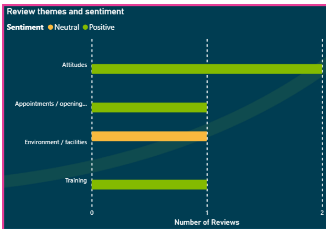
Figure 2 - A graph depicting review themes and sentiment for the feedback collected from the Magdalen Way site of Beaches Medical Centre by the Healthwatch Norfolk Engagement Team

The reviews are displayed in the table below and can be found on our website www.healthwatchnorfolk.co.uk .